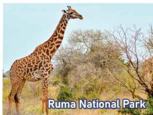
Ruma National Park