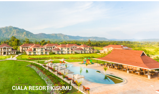
CIALA RESORT KISUMU