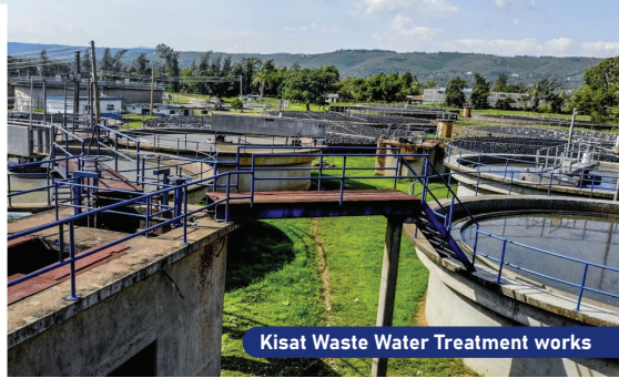
Kisat Waste Water Treatment works